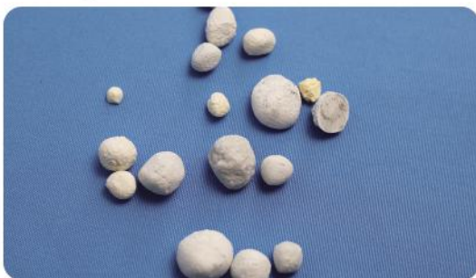
Accessories: Renal calculus