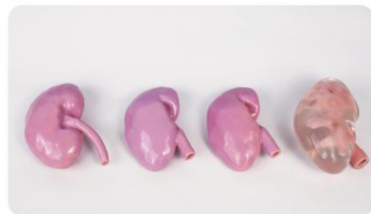
Note: kidneys can be customized according to demands